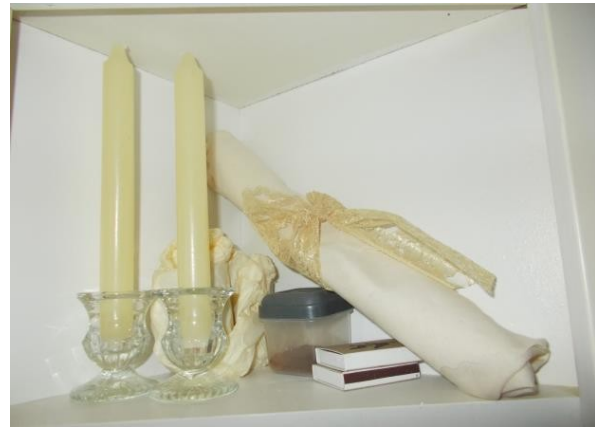
Figure 2. Untitled by [name redacted]

Most Indigenous youth co-researchers expressed a sense of grief and loss due to experiencing multiple layers of intergenerational displacement and trauma through the removal from their communities of origin and simultaneous separation from their siblings. The removal from their communities of origin also impacted their ability to form cultural connections to the land; this is termed in the literature as place attachment, as young people develop a deep emotional bond towards specific geographical places and structures over time due to repeated positive interactions (Dallago et al., 2009).