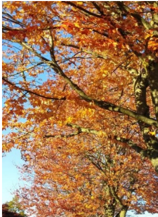
Figure 3. The Fire Within by Ronda Merrill-Parkin

Another co-researcher shared his connection to his neighbourhood and the comfort and sense of belonging he found in a part of the city constantly threatened by increased gentrification (see Figure 4).